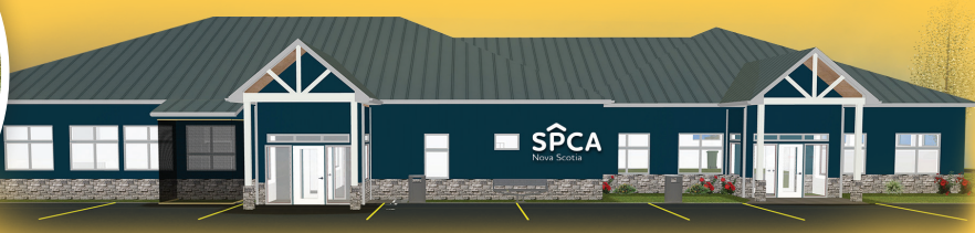
Design is subject to change.

The new North Nova SPCA will break ground by spring, and the fundraising has begun! With the new build, more local pets can – and will – stay here. There will be less travel time, costs, and stress for animals, and more opportunities to adopt for local families.