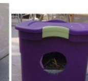
COMPLETED OUTDOOR CAT SHELTER