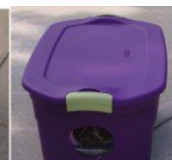
FINAL COVER - ENSURING THERE IS A CLEAR SAFE ENTRY FOR CATS