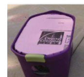
MORE INSULATION SURROUNDING 2ND CONTAINER